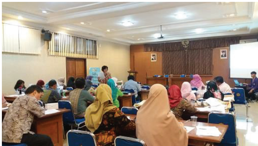
Picture 1. Introduction of a review of relevant literature

The agenda included a lecture, group work, and question-answer sessions. First, the writer introduced herself, including showing her publications to establish her credibility before the audience. Then, she gave a warm-up session by asking the audience to recall the content of the literature review (as the audience had previously written their undergraduate theses). After that, she started her explanation about the literature review, namely the definitions, the purpose, and methods of writing a literature review (see Picture 1). Next, she asked the audience to work in groups to do the exercises given (see Picture 2). One student and one alumni of the Doctoral Program in AEL of AJCUI, one alumni of the Master Program in AEL of AJCUI and one lecturer of the School of Education of Pakuan University became the facilitators for the group work. Finally, the audience and the writer discussed the answers to the exercises.