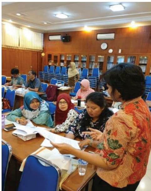
Picture 2. Group work on identifying the content of the review of the literature